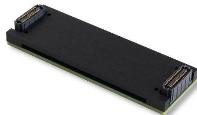
Conduction Cooled QMC

The TQMC700 is available as air cooled and conduction cooled variant.